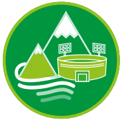
INFRASTRUCTURE AND NATURAL SITES