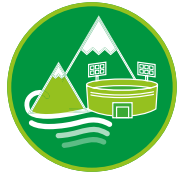
INFRASTRUCTURE AND NATURAL SITES