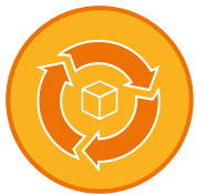
SOURCING AND RESOURCE MANAGEMENT