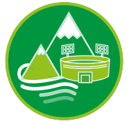
INFRASTRUCTURE AND NATURAL SITES